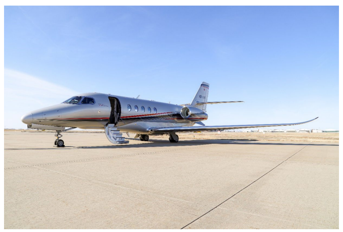
Latest addition to the BHS Aviation fleet: the Cessna Citation Latitude. (High resolution pictures available at <a href="https://bhs-aviation.com/en/news/press">https://bhs-aviation.com/en/news/press</a>)