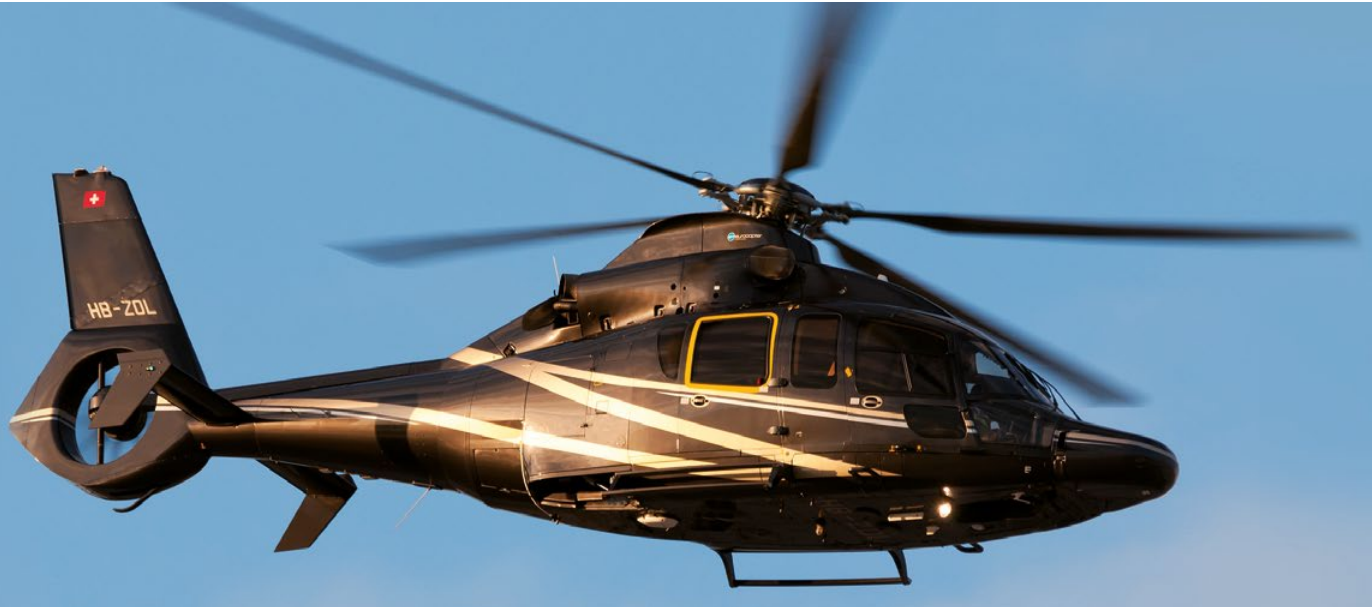
Airbus Helicopters EC155